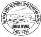
EXHIBIT I, CONT. BBARWA FY 2013 BUDGET CASH FLOW STATEMENT For the Period Ending June 30, 2013